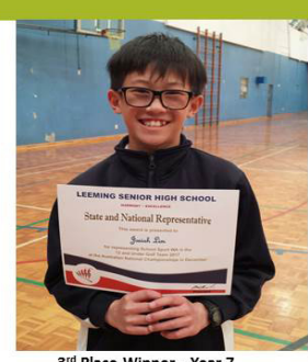
Secondary Schools Golf Championship 2017

Pacific School Games Adelaide 2 – 9 December 2017