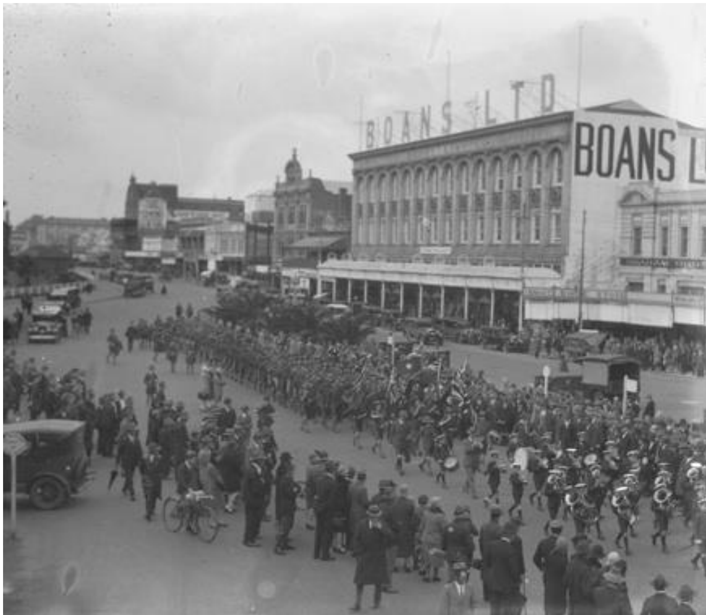
Boy Scout parade with Sea Scout Band, Wellington Street