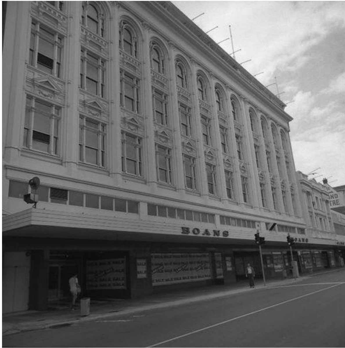
Boan's Murray Street Façade 1986